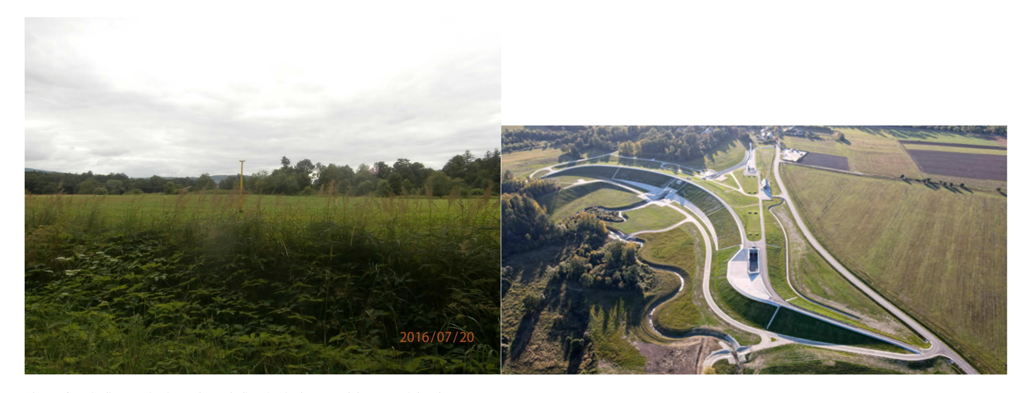
Phot. 2 Gas pipeline running in north-south direction in the area of the reservoir bowl.