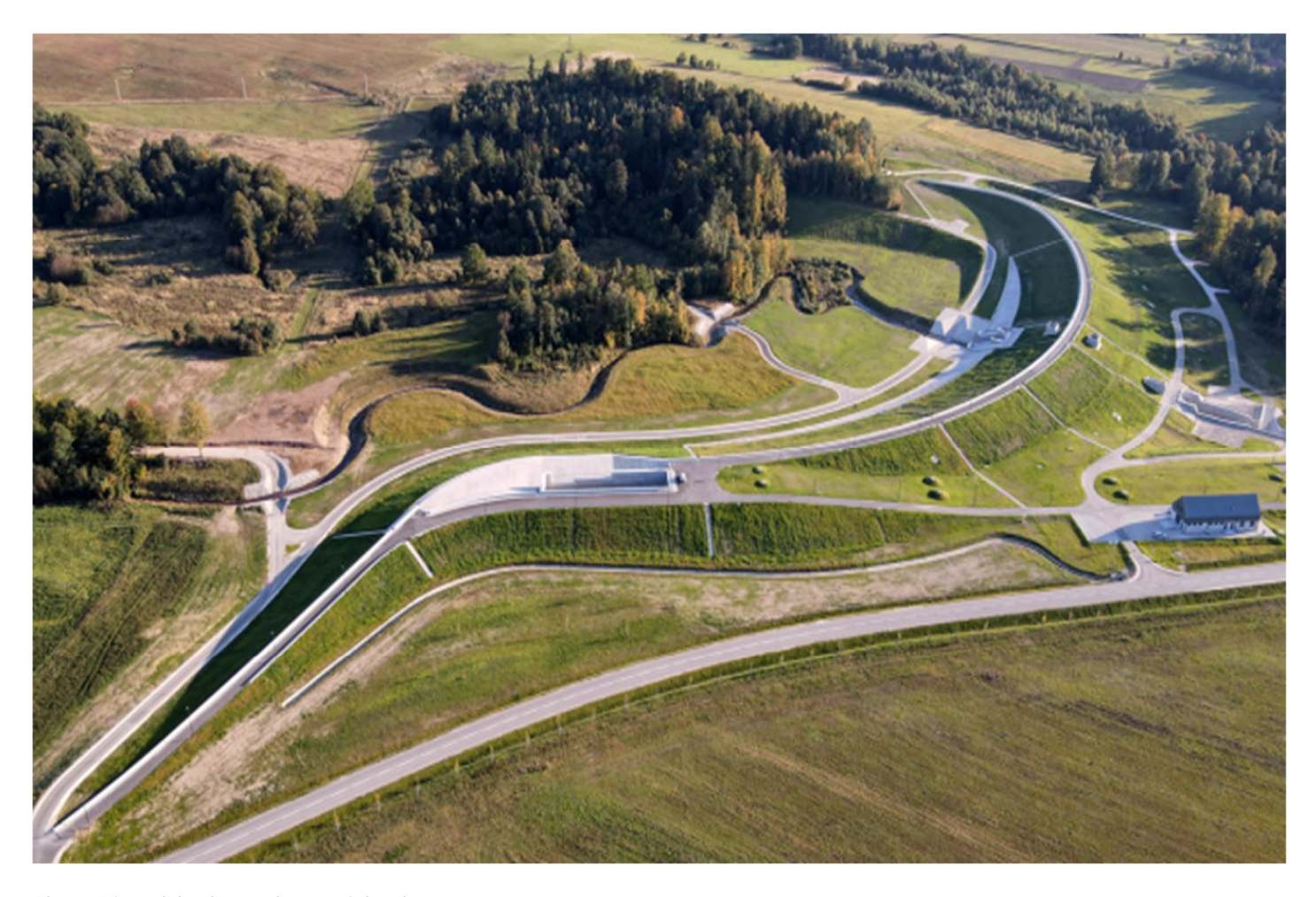
Phot. 6 View of the dam and reservoir bowl.