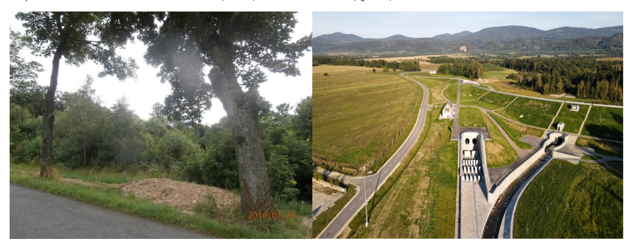
Phot. 1 View from poviat road no. 3233D to plot no. 242/5 before the investment (proposed demolition of existing foundations).

The photos below show: the area before the Investment (left side) and after the Investment (right side).