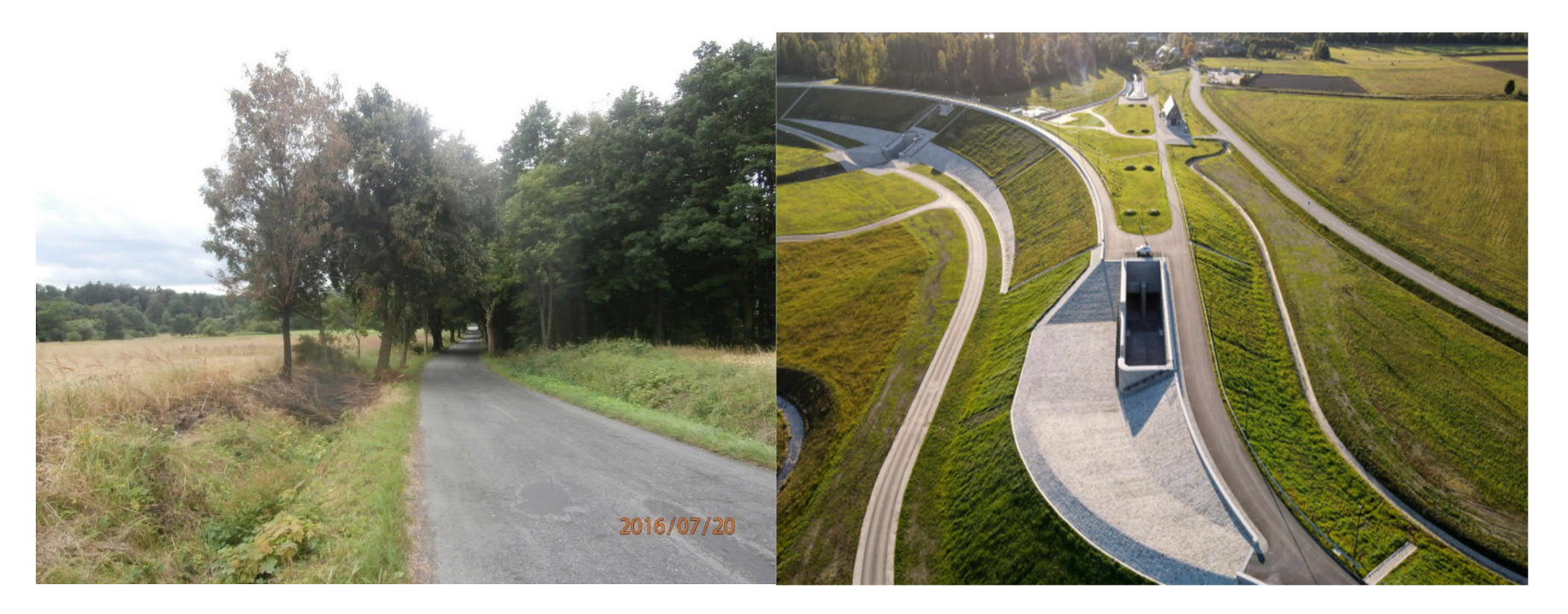
Phot. 3 Section of poviat road no. 3233D running through the area of the right-bank abutment of the dam.