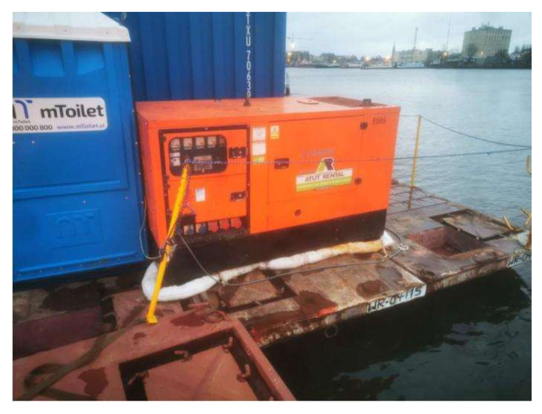
Photo 9 Power generator with additional spill protection on a vessel