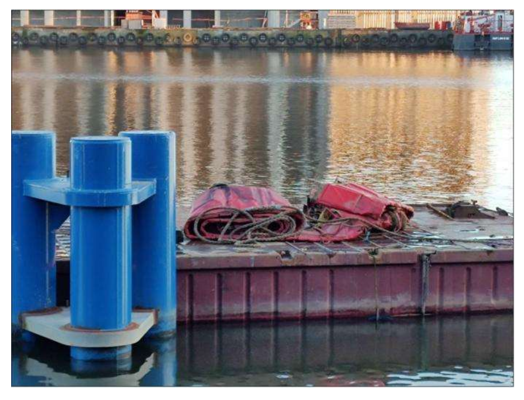
Photo 5 Oil spill containment booms preparation – Szczecin location