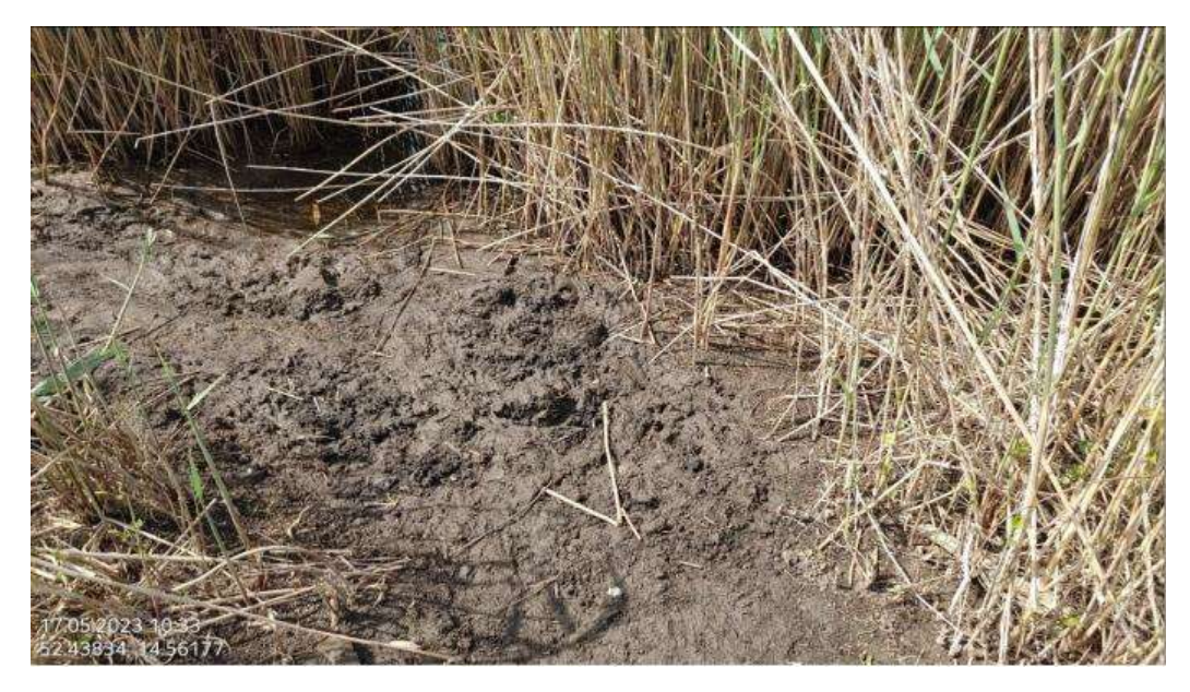
Photo 19 Examples of traces (scent mound) of the beaver Castor fiber in the vicinity of the Kunice dolphin site after the completion of the project