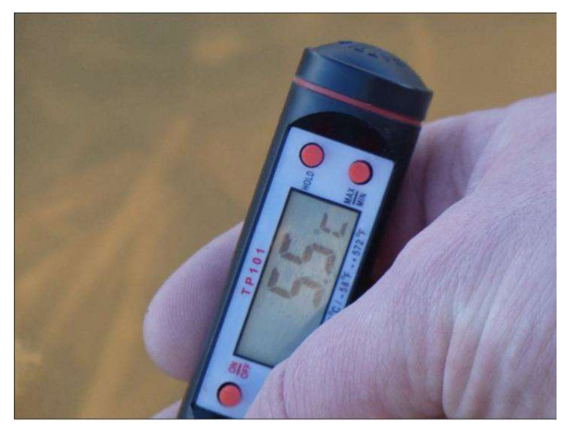
Photo 13 Example of water temperature measurement – Pławidło location