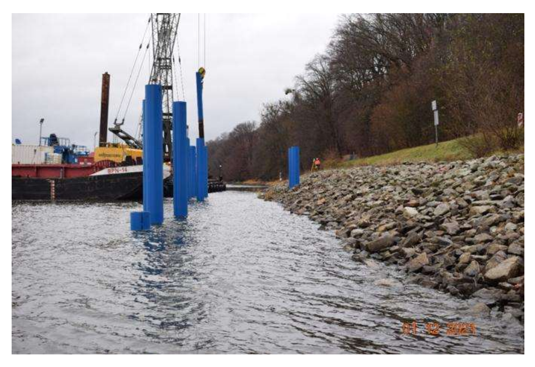
Photo 4 Works carried out from the water side at the Zatoń Dolna location