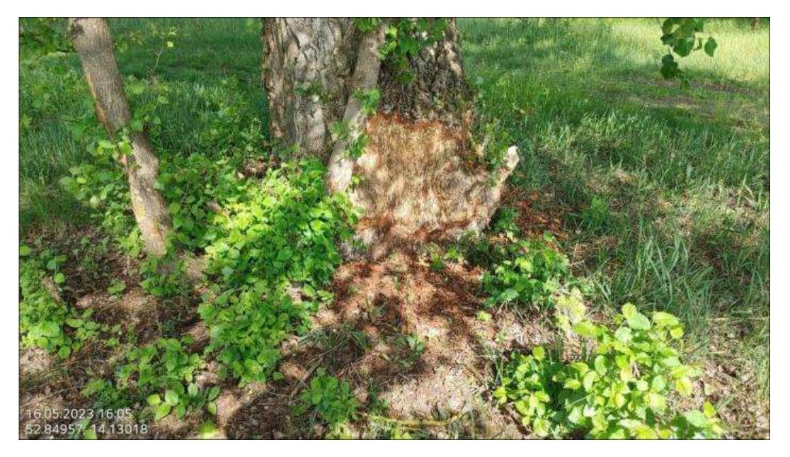
Photo 20 Examples of feeding traces (beaver bites) of the beaver Castor fiber in the vicinity of the Kunice dolphin site after the completion of the Osinów Dolny investment project