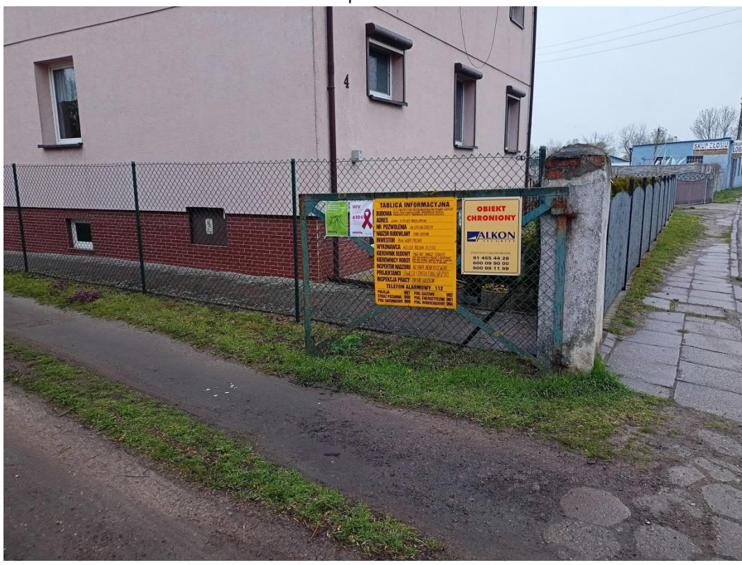
April 2022, Gryfino, information campaign on infectious diseases