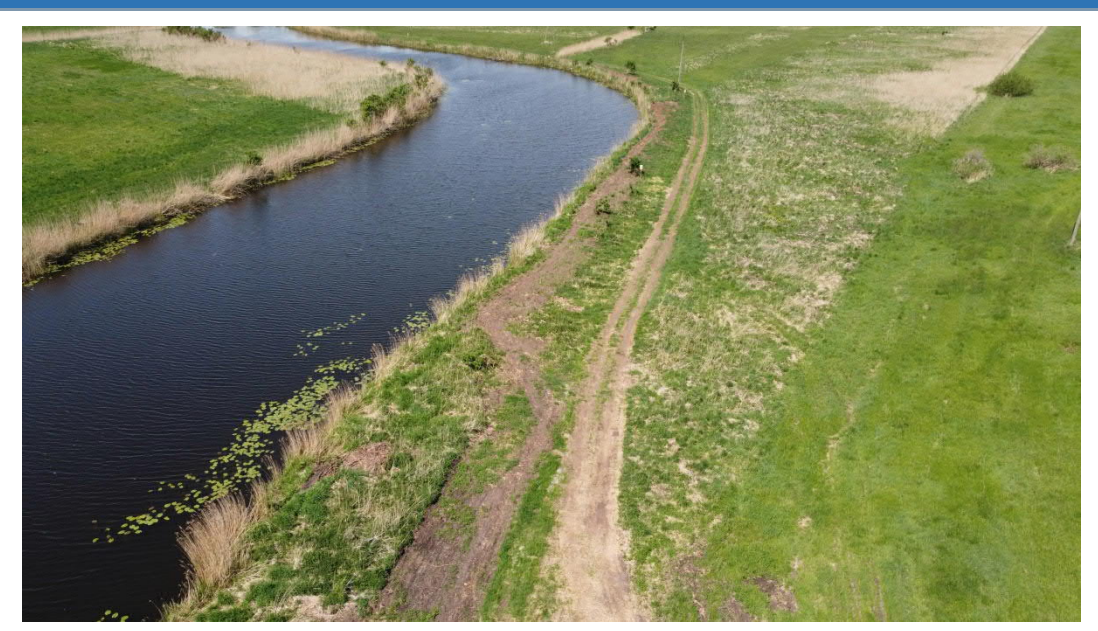
May 2022, Krajnik, completion of works related to laying the cable outside the period of activity of the Aquatic Warbler