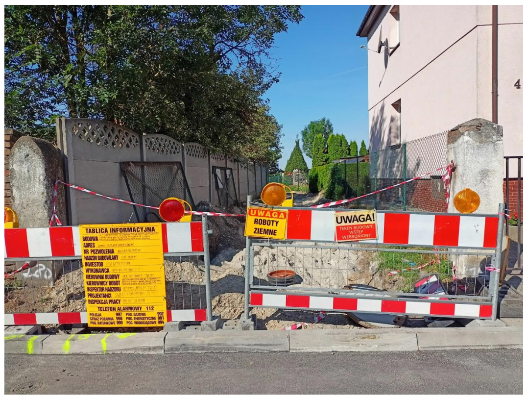
August 2022, Gryfino, construction site signage