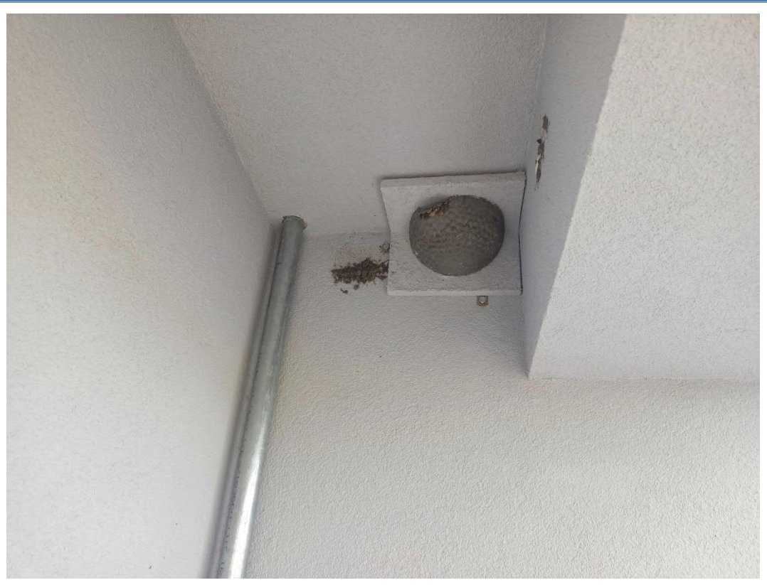
July 2023, Krajnik, one of the nests installed for martins