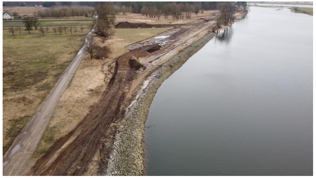
February 2022, Piasek, humus collection in the area designated for the embankment