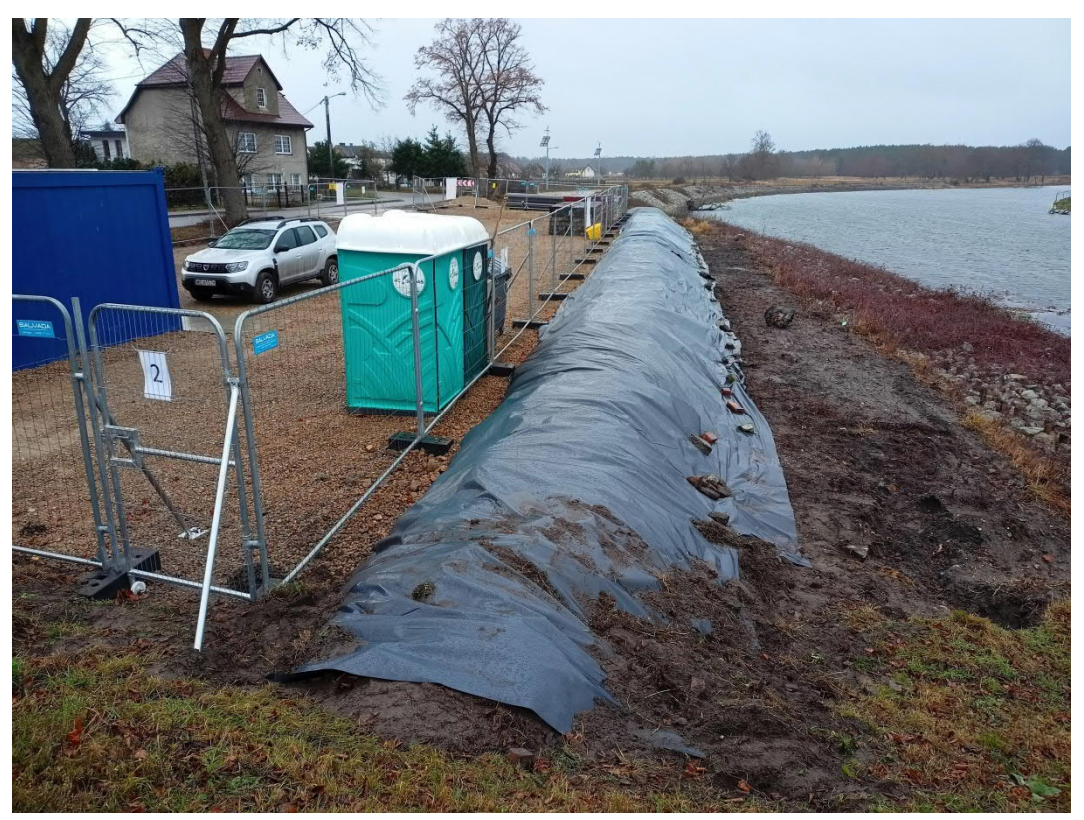
November 2021, Piasek, preparation of construction facilities with flood protection