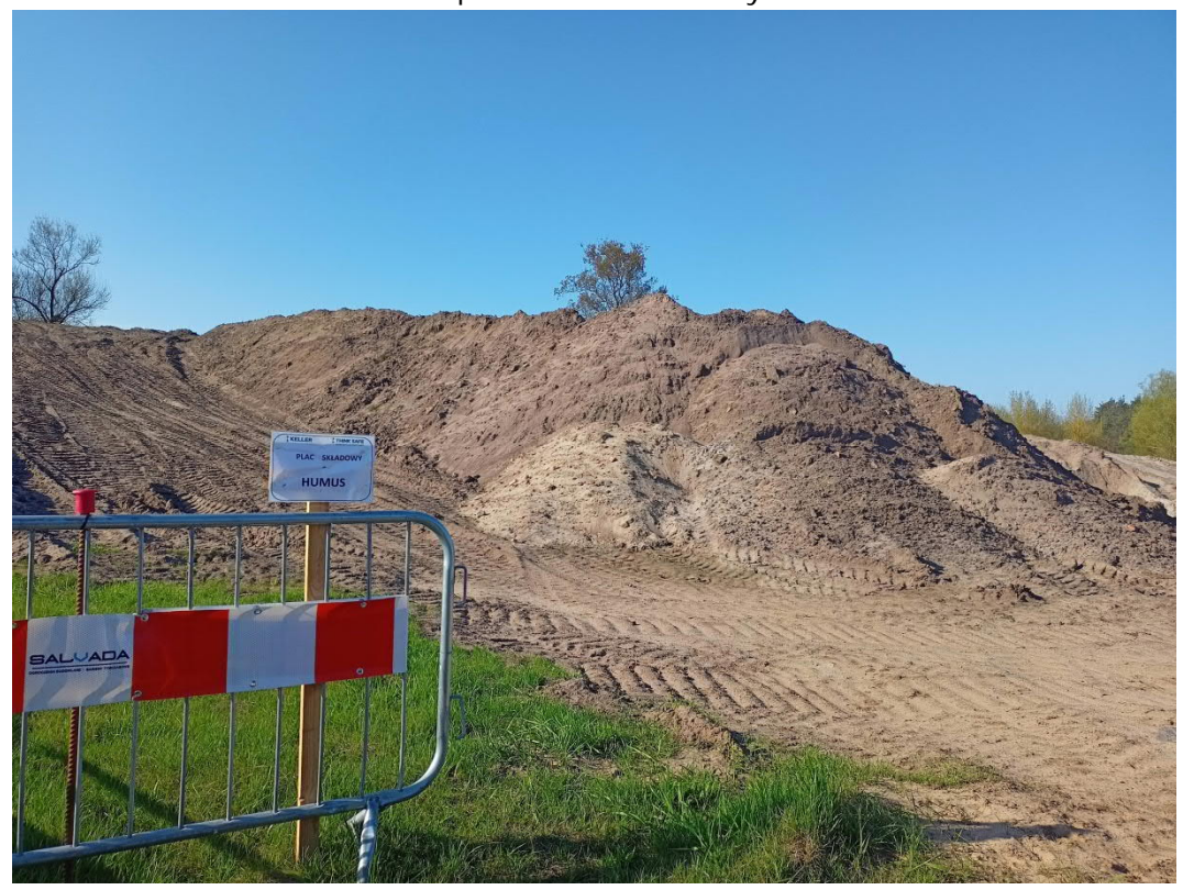
April 2022, Piasek, humus storage site marking