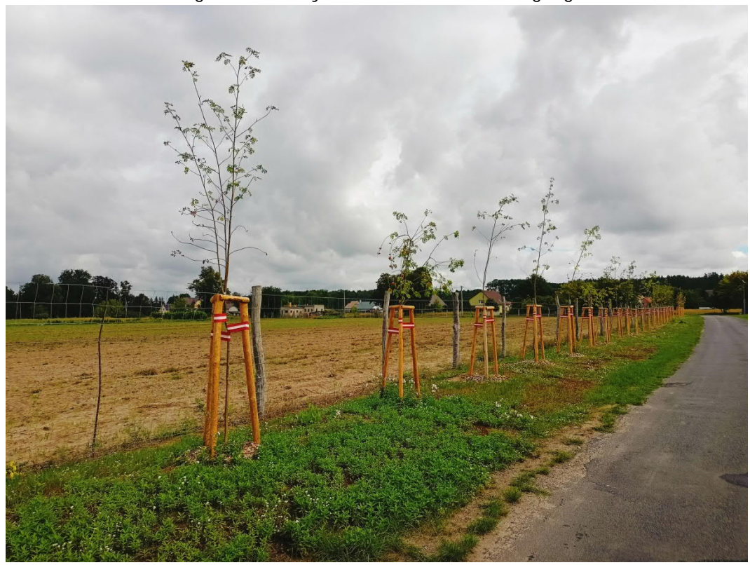
August 2022, Piasek, replacement plantings agreed with the Cedynia municipality