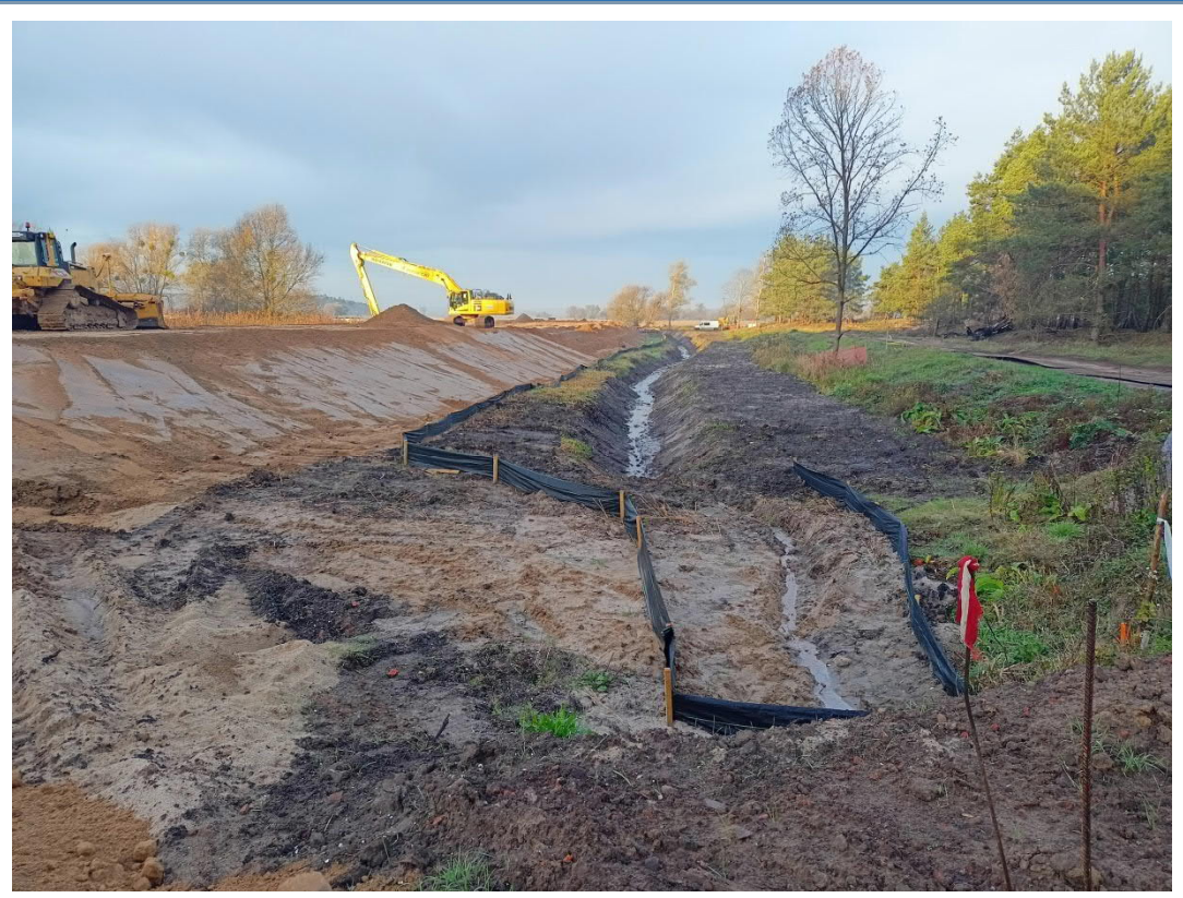
October 2022, Piasek, reptile and amphibian barriers