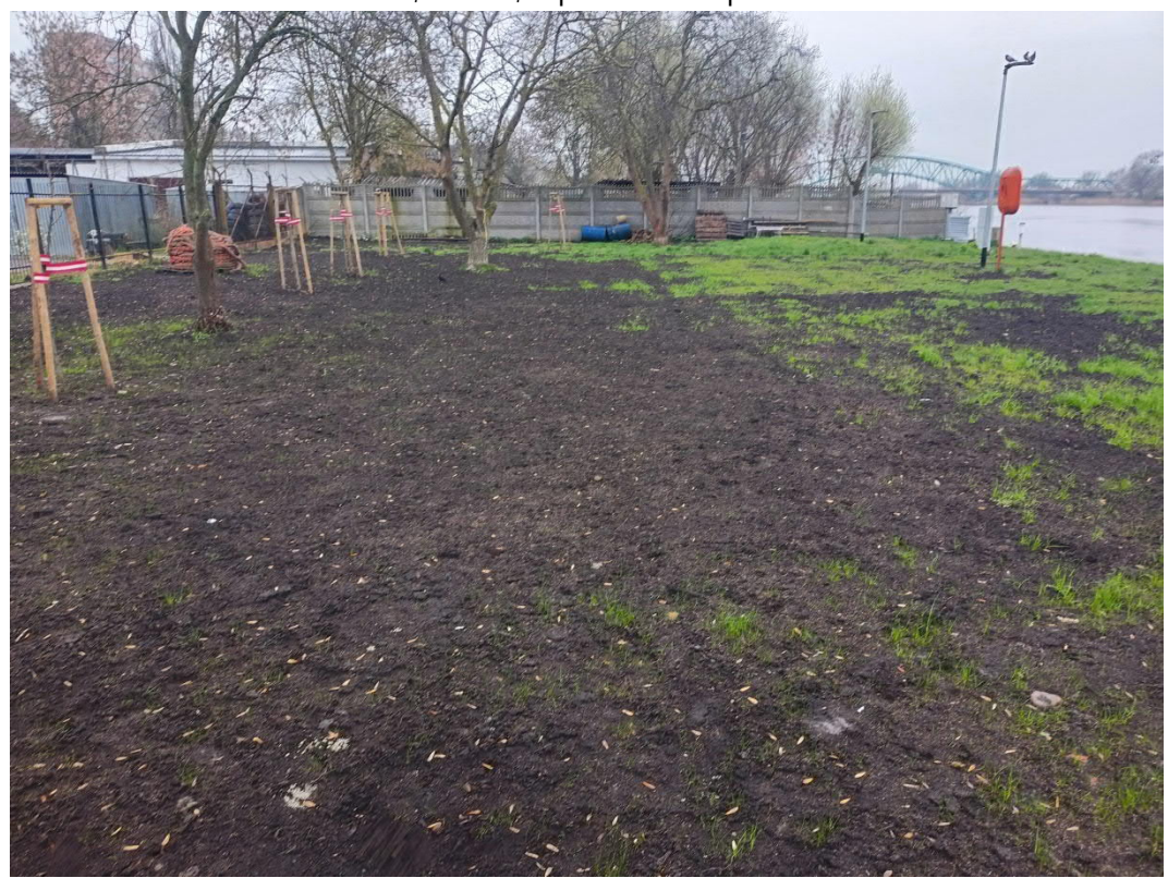
April 2023, Gryfino, reclamation of the place of temporary occupation and replacement planting