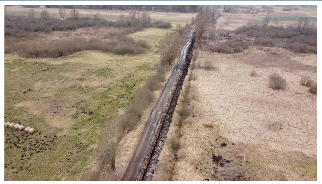
February 2022, Krajnik, execution of works related to laying the cable outside the period of Aquatic Warbler activity