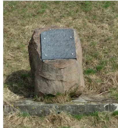
Photo. 2 Stone with commemorative plaque.