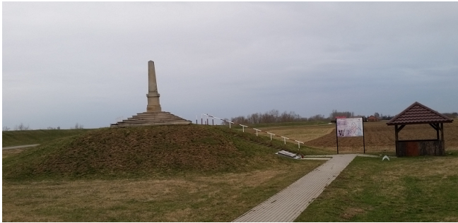
Photo. 1 Mound with monument and cemetery from 1809.